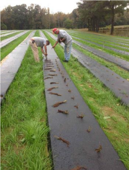
Planting complete: How the planting looks after setting.